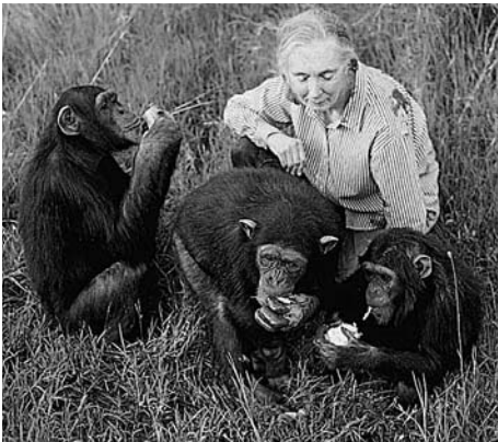
Goodall observing chimpanzees.

subjects. After nearly sixteen months of diligent observation, in 1961 Goodall witnessed something that would turn the scientific world upside down. Until then, it was believed that only humans made and used tools. However, Goodall saw two chimpanzees, which she named David Greybeard and Goliath, pulling leaves from plant stalks, inserting the bare stalks into termite mounds, and eating the termites that crawled onto the stalks. Chimpanzees were making and using tools! “I’m not the first person to have seen that,” Goodall pointed out, “Lots of Africans had seen it. But I was the first scientist to report it.” Shocking the scientific world, Goodall’s discovery blurred the line between humans and animals, forcing scientists to redefine tool, redefine human, or accept chimpanzees as human. The discovery attracted additional funding, particularly from the National Geographic Society, which allowed the research to continue while Goodall earned a Ph.D. from Cambridge University in ethology, the study of the behavior of animals in their natural habitat.