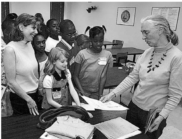
Goodall reading letters from students.

teens to value all life, Goodall developed the Roots & Shoots global program for youth. Active in more than ninety-four countries to date, Roots & Shoots teaches