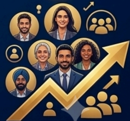
Growing Audience Icon