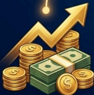
Growing Income Icon