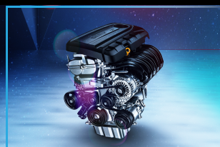
1.5L 4-Cylinder D-CVVT Engine