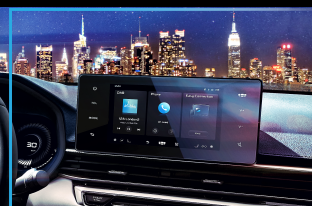
8-Inch Infotainment Screen