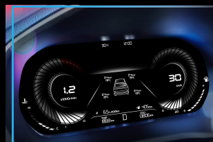
Full Digital Instrument Panel