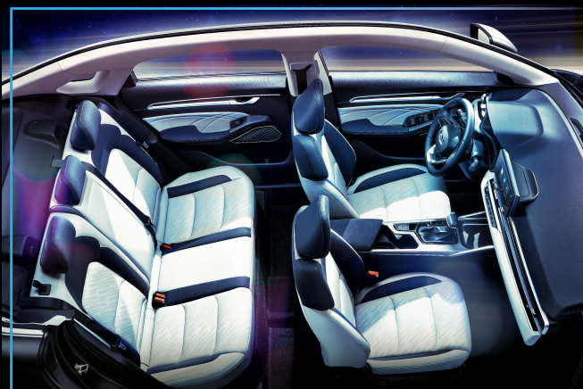
Comfortable Premium Interior