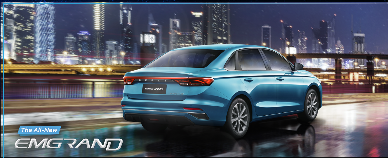
The All-New EMGRAND