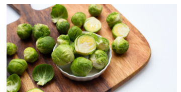
Brussel Sprouts 1 cup (90 g) = 3 g protein