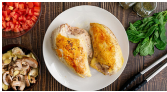
Cooked Chicken Breast 3 oz (85 g) = 28 g protein