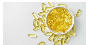
Cod Liver Oil (speak with your provider about brands)