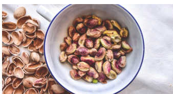
Pistachio 1/4 cup (30 g) = 6 g protein