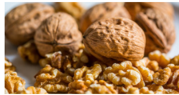
Organic Raw Walnuts