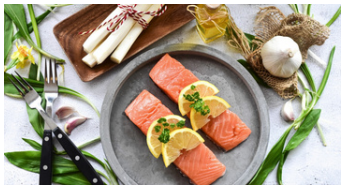
Wild Caught Salmon

Here are some examples of quality omega-3 sources: