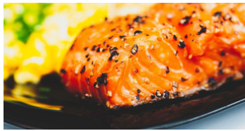
Cooked Salmon 3 oz (85 g) = 22 g protein