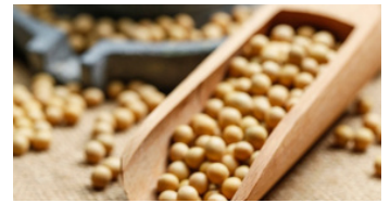
Organic Non-GMO Soy Beans/Edamame