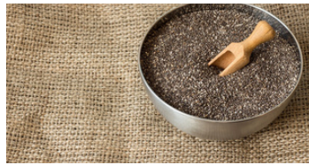
Organic Chia Seeds