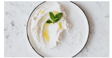
Low Fat Cottage Cheese 1 cup (226 g) = 28 g protein