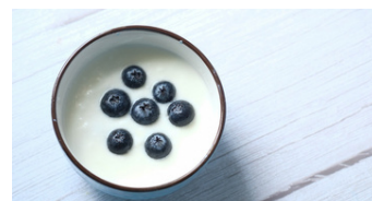
Low Fat Greek Yogurt 1 cup (240 g) = 28 g protein