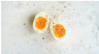
Eggs 1 large egg = 6 g protein 1 cup (240 g) egg whites = 27 g protein