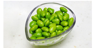
Edamame 1 cup (120 g) = 12 g protein