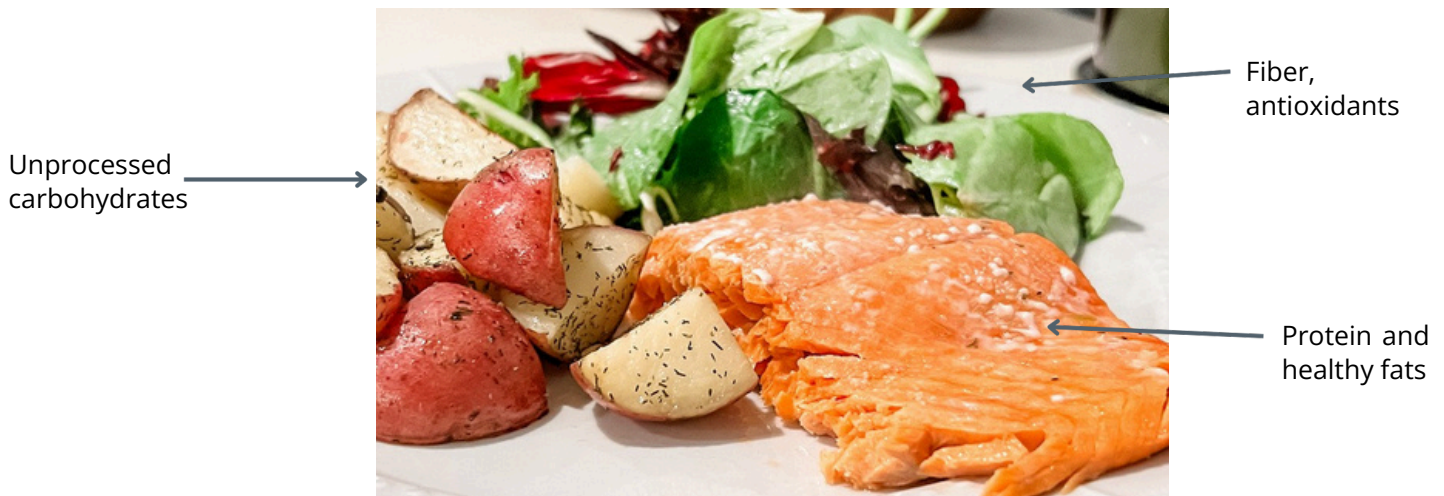
Example of a Balance Plate

To improve insulin sensitivity, meals should be balanced with clean protein, healthy fats, and fiber. Healthy fiber is abundant in whole foods such as vegetables, fruit, beans, legumes, and minimally processed grains (such as quinoa or barley).