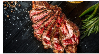
Lean Cooked Steak 3 oz (85 g) = 26 g protein