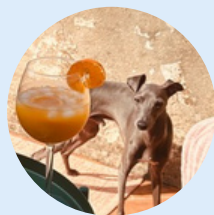
SID 🐾 CO WORKER, SNUGGLE MASTER & CARROT LOVER