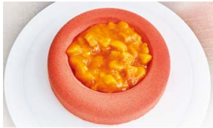
50. Leave the entremets to defrost, then finish the decoration by adding the apricot confit d'abricots.