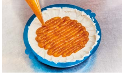
44. Place 170 g of apricot compote evenly in the center of the mousse.