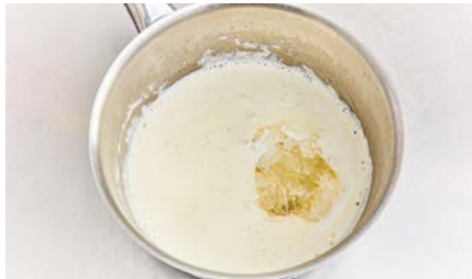
39. Remove from the heat and add the rehydrated gelatine sheet, squeezed dry.