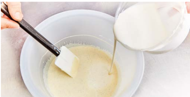
41. Then add the second part of the cold cream.