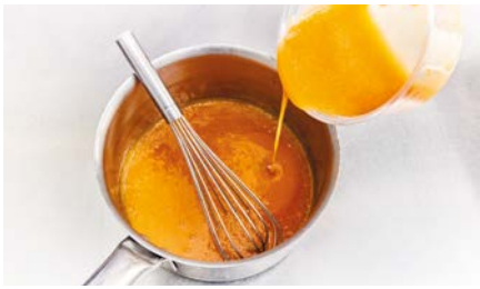
35. Add the apricot purée (2) and blend. Leave to cool completely.