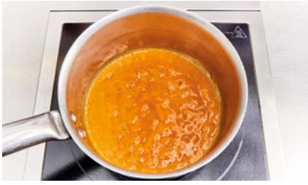
32. Heat the apricot purée (1).