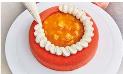
52. Use a saint-honoré nozzle to pipe the cream around the apricot confit.