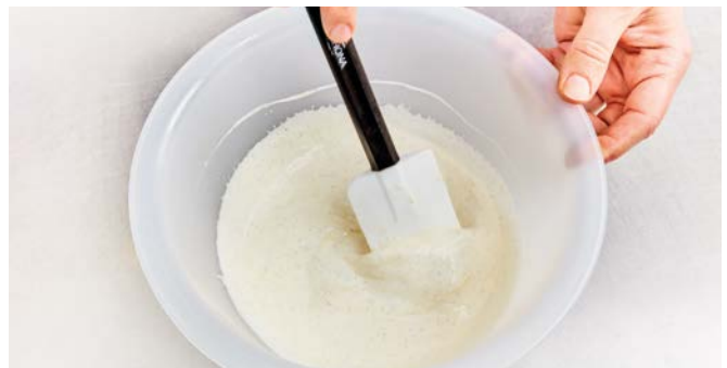
42. Blend and leave to cool overnight before use.