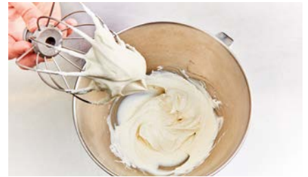
51. Using a mixer, whip the light vanilla cream until it resembles whipped cream.