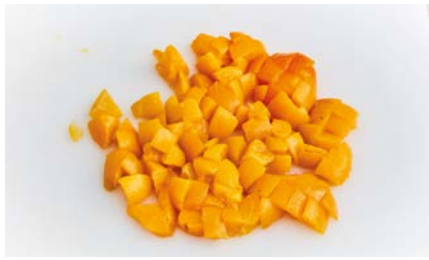
36. Cut the apricots into halves, then into 1 cm cubes.