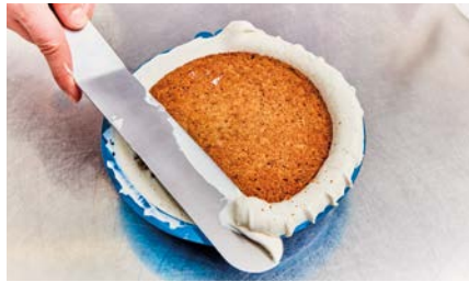
47. If necessary, add Bavarian mousse and smooth. Place in the freezer overnight.