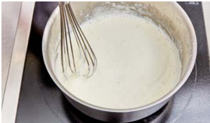
38. Heat the first part of the single cream with the vanilla.