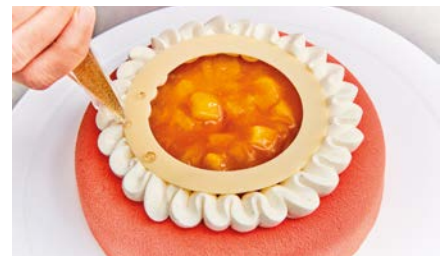
54. Decorate with a few dots of vanilla topping.