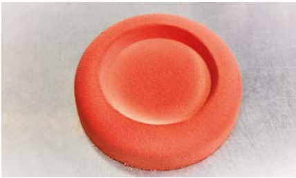
49. Heat the apricot velvet flock to 35°C and spray the entremets using a spray gun.