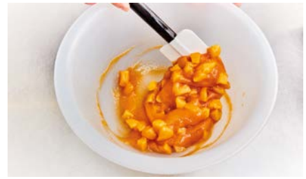
37. Thin the apricot confit, and gently add the diced apricots.