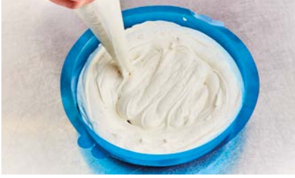
43. Pour 3/4 of the vanilla Bavarian mousse into a 16 cm-diameter, 3.5 cm-high mold with a hollow in the center, and line the sides with a spatula.