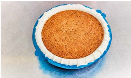
46. Press lightly on the base to level it with the edge of the mold.