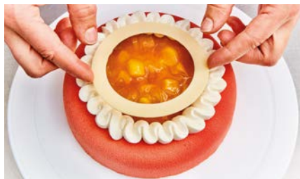
53. Place a disc of openwork white chocolate on top.