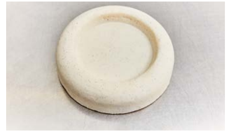
48. Once frozen, remove from the mold and turn over.