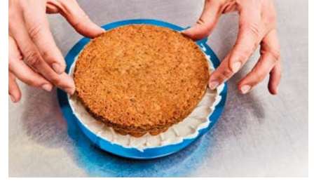
45. Add the shortbread and financier base, placing the side of the financier against the mousse.