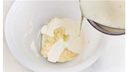
40. Pour over the white chocolate (previously melted in the microwave) in three batches.