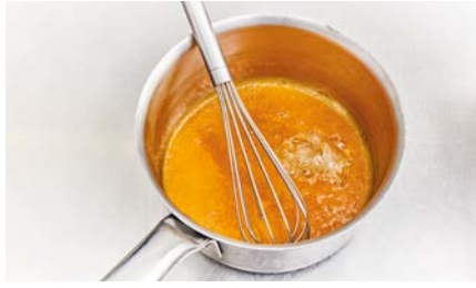
33. Remove from heat and add the gelatine rehydrated and wrung out sheets.