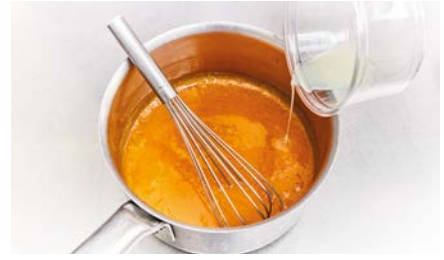
34. Add the lemon juice.