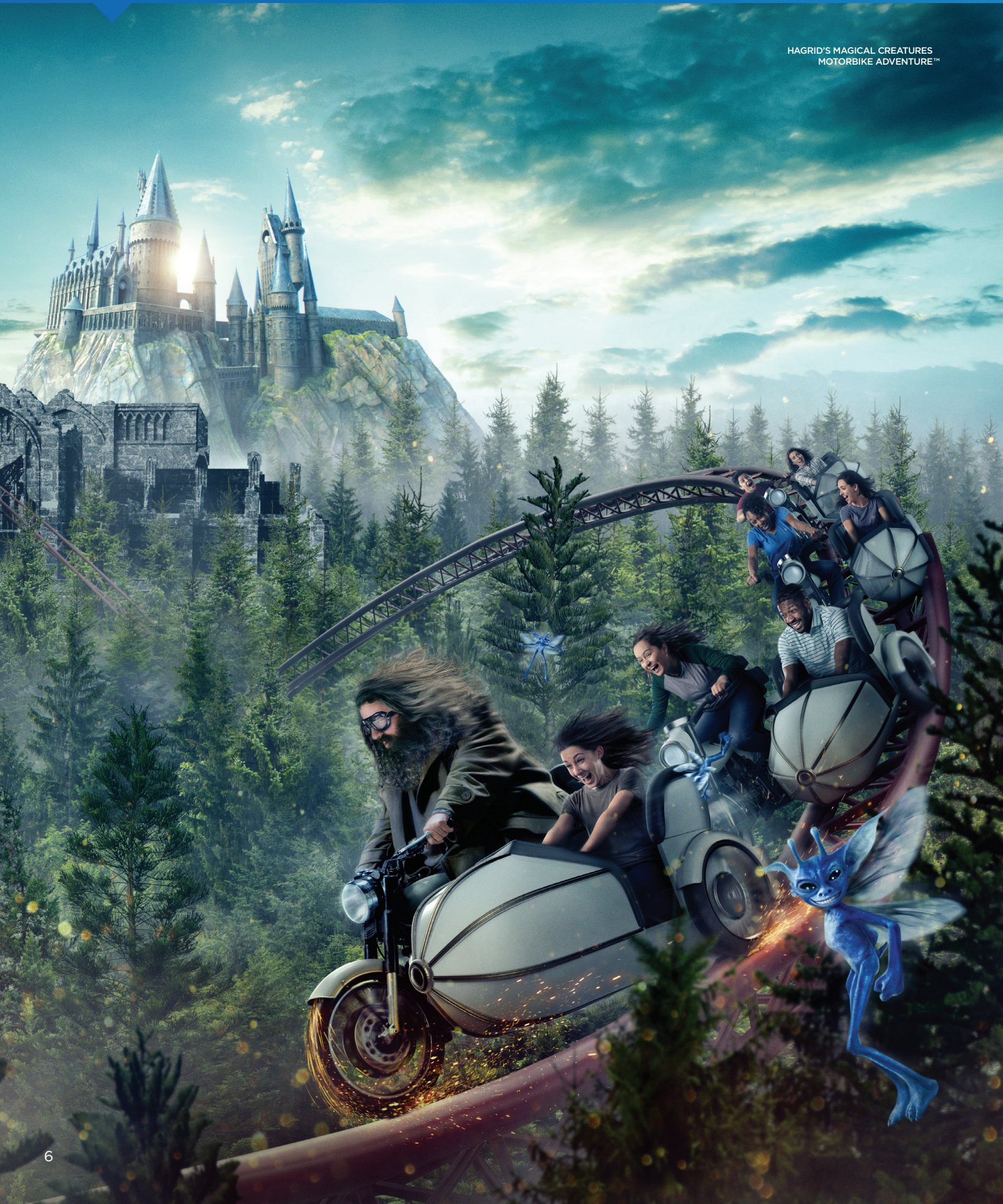
HAGRID'S MAGICAL CREATURES MOTORBIKE ADVENTURE™