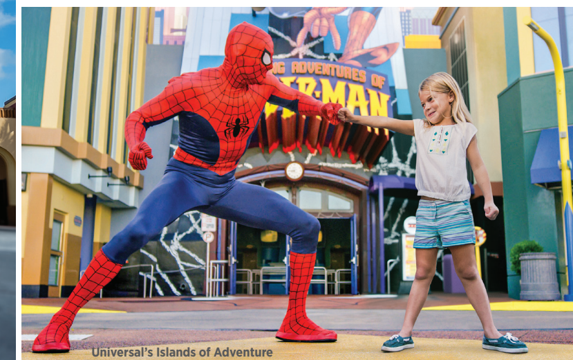
Universal's Islands of Adventure

In Universal's Islands of Adventure you'll walk side-by-side with super heroes, beasts and magical creatures to enter lands where imagination is real. Your adventure begins in the only park named the #1 Amusement Park In The World, five years in a row—by TripAdvisor® Travelers' Choice.