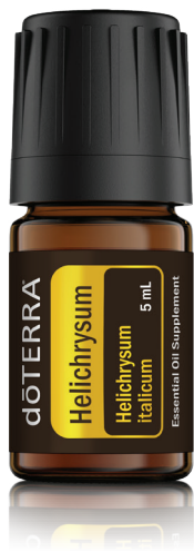
Helichrysum 30410001 5 mL | 73 PV Wholesale: $82.00