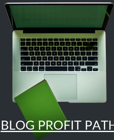
BLOG PROFIT PATH