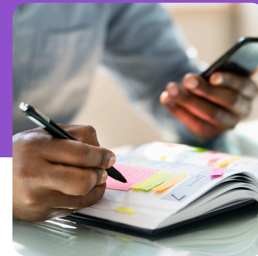
Plan In Calendar