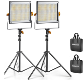
Newer Dimmable Bi-Color LED Video Light Kit Adjustable, consistent LED lighting for video and photography