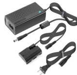
Continuous Power Eliminates dependence on battery operation