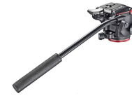
Manfrotto XPRO Fluid Head Smooth panning for video camera stabilization