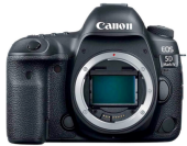
Canon EOS 5D Mark IV High-quality video, versatile, excellent autofocus, full-frame sensor, reliable for YouTube content