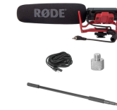
Rode VideoMic Pack Enhanced audio quality, minimizes handling noise, perfect for YouTube video recording