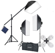
StudioFX Softbox Lighting Kit Beginner- and budget-friendly option to improve lighting conditions & enhance video quality