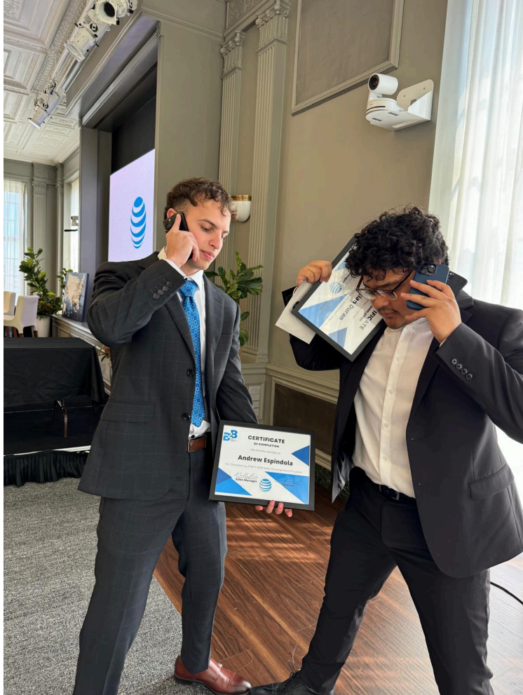
Me On The Left

Soon after graduating, I got a corporate sales job at a fortune 25 company.