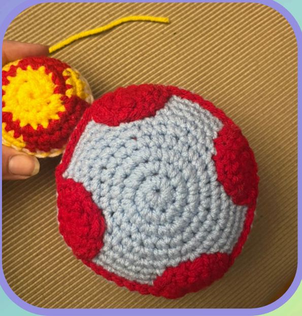
EAR #1, PIC #1

SEW EAR #1 & 2 TO TOP LEFT & RIGHT OF YOUR BODY AS SHOWN IN PIC #1 & 2