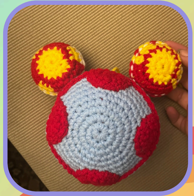
EAR #2, PIC #2

MAKE SURE THE COLORS MATCH UP LIKE SHOWN IN THE PICTURES FOR ACCURACY