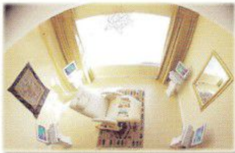
The Jockey Club 4 Unit EES in Miami, Florida

The Energy Enhancement System™ has been featured on the "Beauty Show" which is to be airing as part of the In-Flight entertainment on all major airlines in the US and around the world. This show has recently been picked-up by Turner Broadcasting with plans to deliver the show to millions of homes on their cable television stations. Additionally, a new show called "Healthy Living" hosted by Linda Gray of television's Dallas fame will also be featuring the technology.