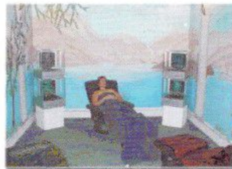
The Spine Institute 8 Unit EES in Palm Desert, California