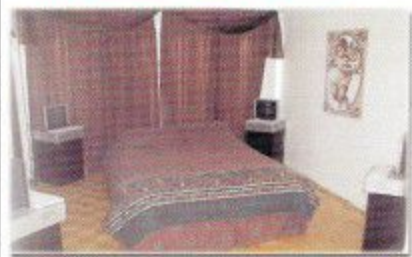
Put a system around your bed!