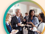
12 NOON Networking Event