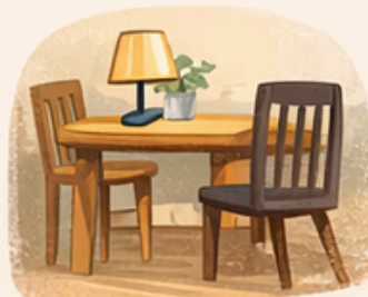
Dining room table