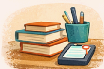
Phone on desk/table

What we need to remove or manage : _____