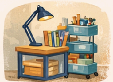
Rolling cart setup