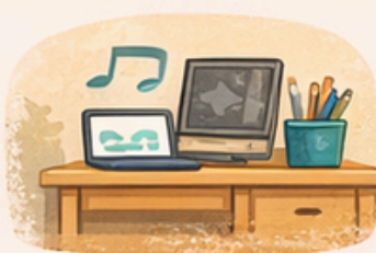
Toys, games, or hobby items visible