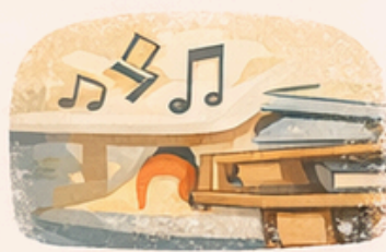
Busy wall decorations