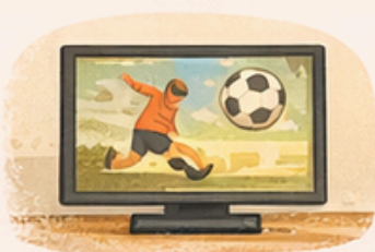
TV in line of sight