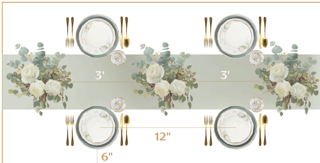
Diagram 1. Table Setting Key Measurements