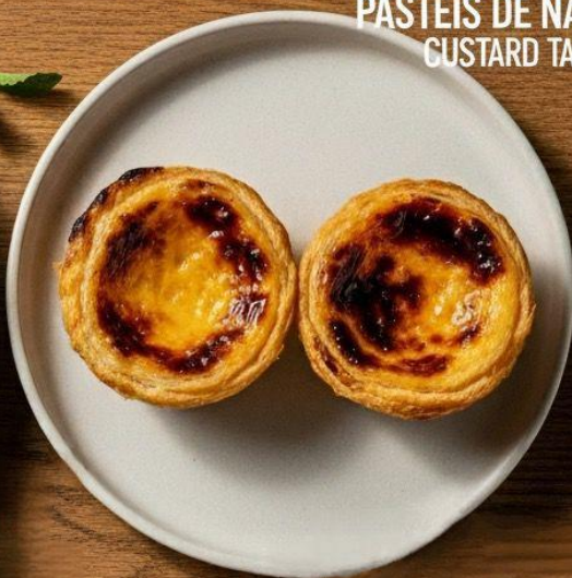
PASTÉIS DE NATA CUSTARD TARTS