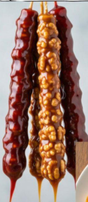
Churchkhela (Walnut-Must Ropes, Georgia)