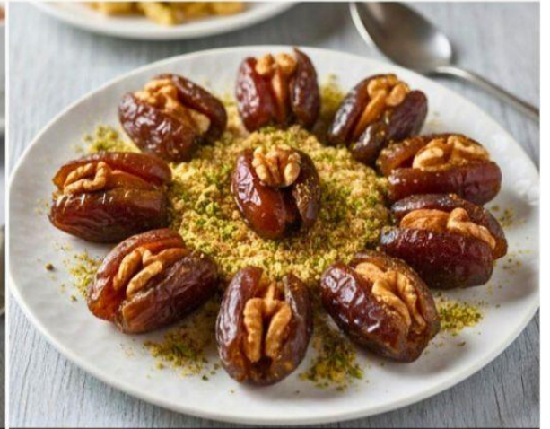
Ranginak Date-Walnut Dessert, Iran