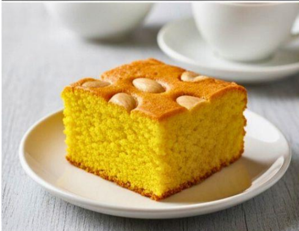
Sfouf (Tumeriro Semcenlia, Lebanon)