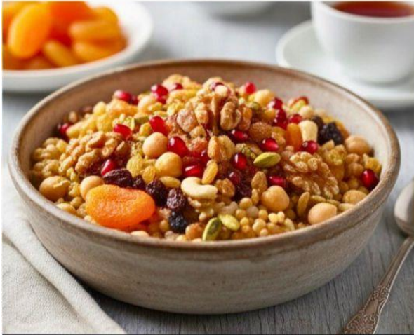
Aşure (Noah's Pudding, Türkiye)