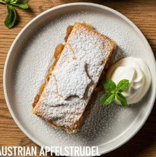
AUSTRIAN APFELSTRUDEL (LIGHTENED APPLE STRUDEL)