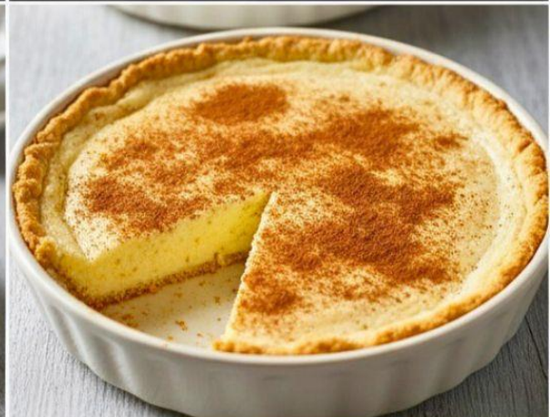
Milk Tart, Sourica, Light Version)