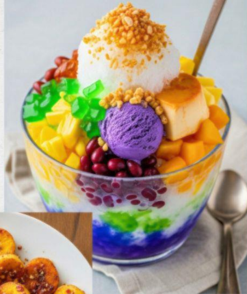
Halo-Halo (Light Fruit & Ice Dessert, Philippines)