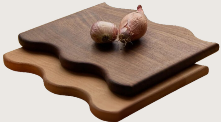
Pretty Boards from Avocado (but only the single slab options)