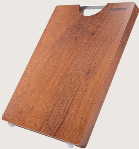
Inexpensive Amazon Option