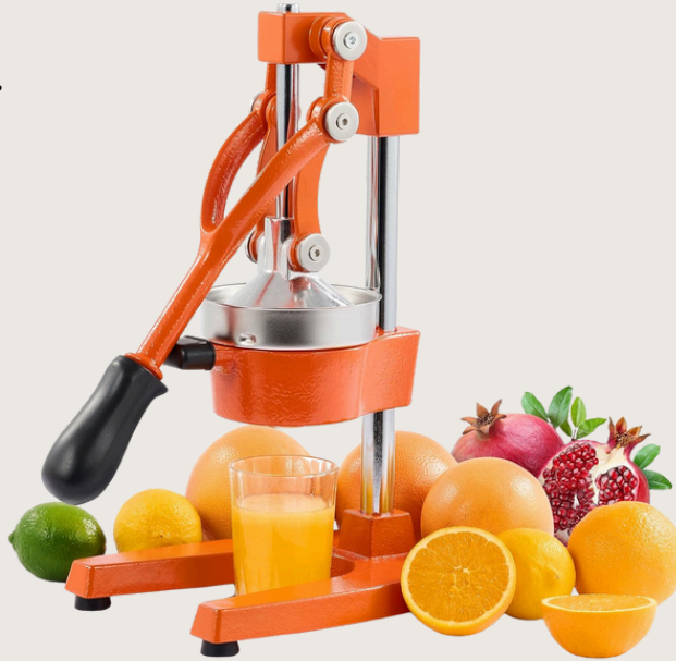
Cold Press Citrus Juicer