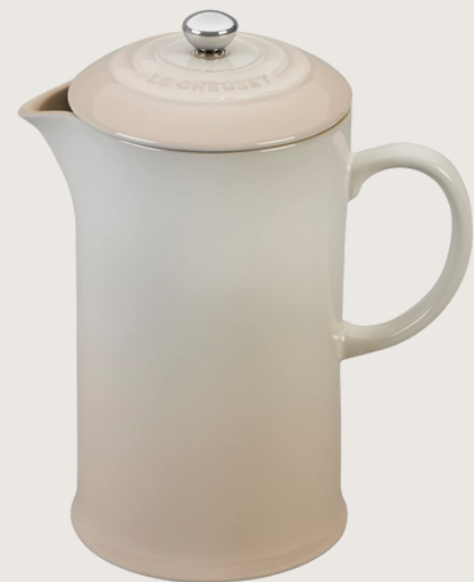
French Press (Glass or Ceramic over stainless)