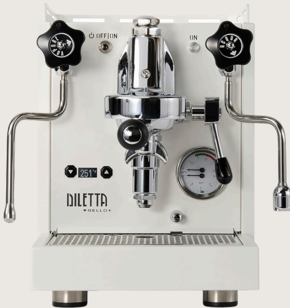
Bougie Coffee Maker with stainless steel components