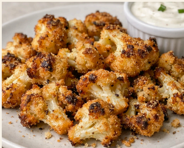
Garlic Parmesan Cauliflower (No-Mush Method)