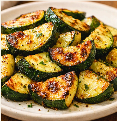
Air Fryer Zucchini (Not-Watery Method)