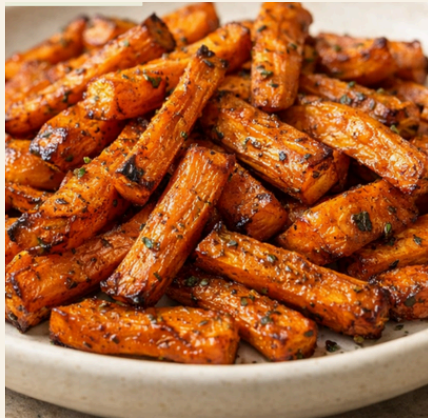
Roasted Air Fryer Carrots (Sweet, Caramelized Edges)