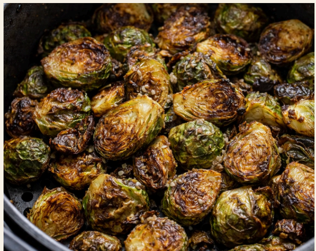
Crispy Brussels Sprouts (Deep Brown, Not Bitter)

Simple air fryer vegetable recipes for crisp sides, better browning, and everyday cooking.