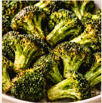
Crispy Air Fryer Broccoli (Brown-Edge Method)