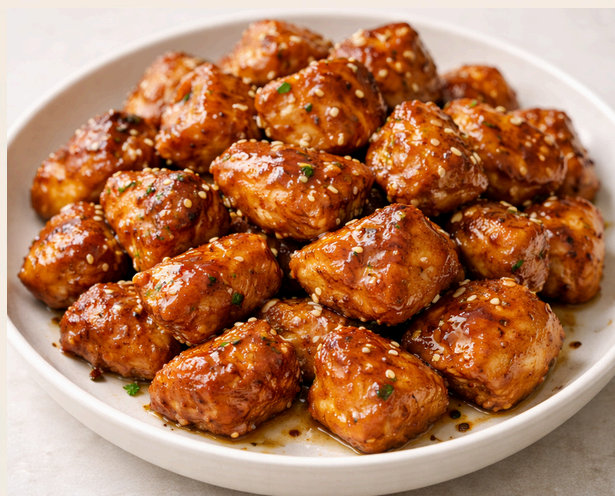
5 Sticky Honey Garlic Air Fryer Chicken Bites (Restaurant-Style Glaze – No Breading)

Simple chicken recipes for crispy, juicy, everyday air fryer cooking.