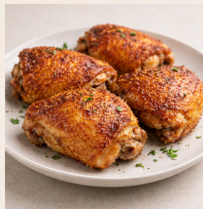
3 Crispy Air Fryer Chicken Thighs (Juicy, Skin-On)