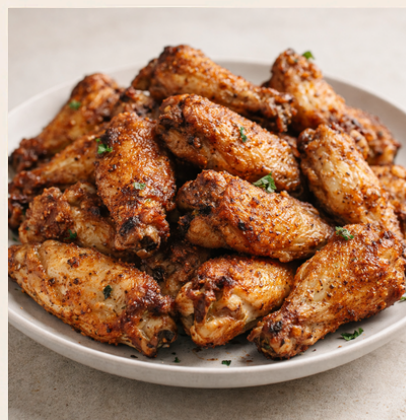
1 Crispy Air Fryer Chicken Wings (No-Fail)