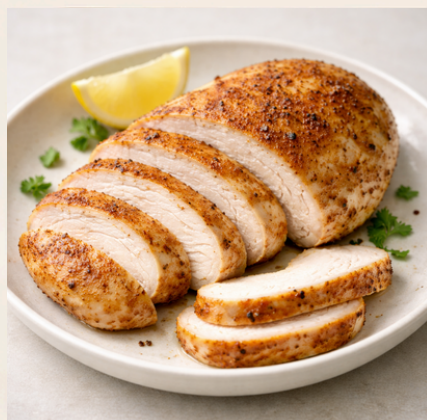
2 Juicy Air Fryer Chicken Breast (No-Dry Method)