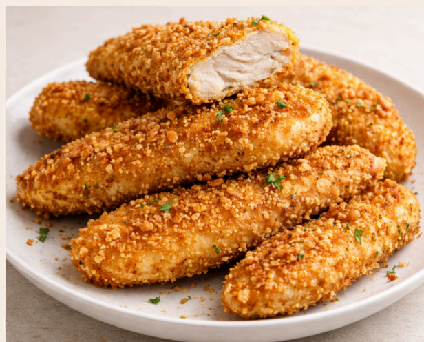
4 Crispy Air Fryer Chicken Tenders (2-Ingredient Crunch Trick)