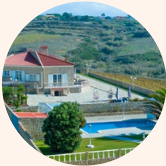
Private family retreat