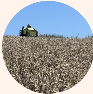
Agricultural and regenerative project