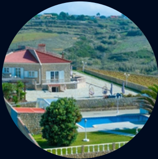
Private family retreat