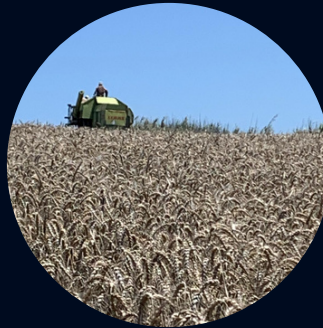
Agricultural and regenerative project