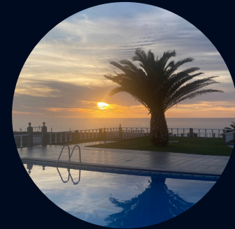
Long-term capital preservation

Legacy is not built in quarters. It grows in decades.